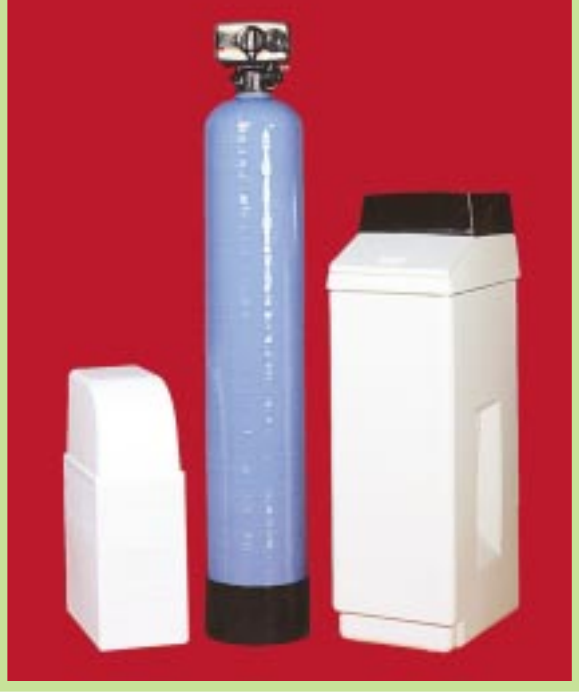
Fleck 5600 valved system shown between a Trojan and a Caribbean Cabinet.

For fixed or consistent flow rates a simple timer controlled valve will suffice. This will effect