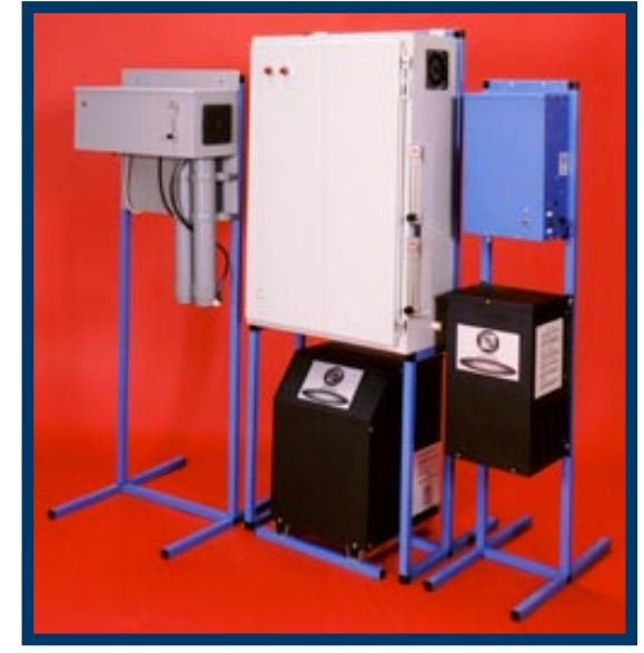
OZ2BTU Ozone Generator on custom frame.

The guidelines are 0.4 mg of Ozone required for every 1 mg of Iron, 1.0 mg Ozone per 1 mg Manganese and 3.0 mg per 1 mg of Hydrogen Sulphide. It is essential that sizing recommendations are made by water treatment professionals experienced with Ozone systems,