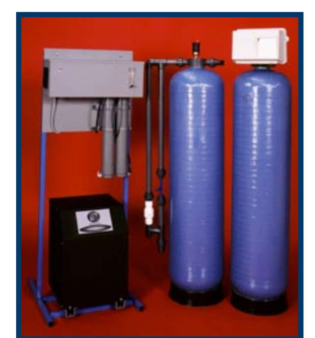
OZ2BTU Ozone Generator on custom frame above PP2450 Air Preparation Unit. 1354 contact assembly with automatic bypass valve and Mazzel venturi. 1354 filter with 2510 valve.

The Ozone layer is found in the uppermost part of the earth's atmosphere between 20,000 and 30,000 metres and provides an important natural barrier to ultraviolet radiation from the sun. The Ozotech Ozone generators do not adversely affect the Ozone layer since they manufacture the Ozone used to purify water from Oxygen in the atmosphere. Local depletion of Oxygen