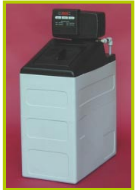
Fleck 5700 Valve and Trident Cabinet illustrated