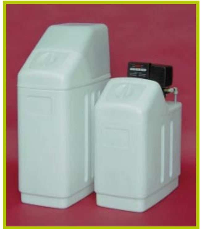
Titan 14 Litre softener with hood, Titan 10 Litre softener with 5700 valve illustrated.

The result is rugged, quality softeners which offer the low operational costs of premium domestic softeners at a fraction of the purchase price.